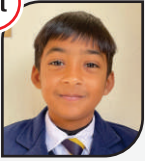
TAWASAL ABASS FG Public School Boys Sanjwal Attock RS. 7000, CERTIFICATE MEDAL, PEN