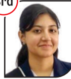
AYAT FATIMA Defence Degree College for Women Lahore RS. 3000, CERTIFICATE MEDAL, PEN